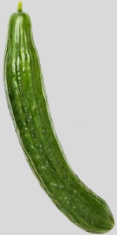
Price comparison organic vs. conventional

PRICE ORGANIC CUCUMBER 10,00 DKK SHARE 37%